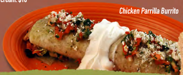
Chicken Parrilla Burrito

Grilled Chicken, black beans, white rice and mixed vegetables wrapped in a flour tortilla. Topped with our salsa verde, pico de gallo, cheese and sour cream. $16